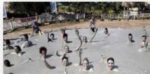
L'eau Michel Mud Volcano