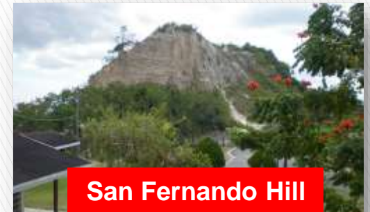
San Fernando Hill

Photo credit: Grant Memorial Presbyterian School, 2017